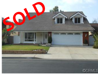
WITH 9 OFFERS CARRIE'S BUYER GOT IT