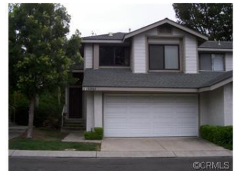
CARRIE'S SELLER GOT 9 OFFERS