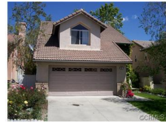
CARRIE'S SELLER GOT 4 OFFERS

AND CARRIE CURRENTLY HAS ALL OF THESE IN ESCROW!