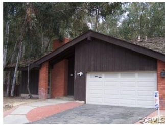
CARRIE'S SELLER GOT 6 OFFERS