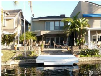
1 ST DAY ON THE MARKET CARRIE'S BUYER GOT IT